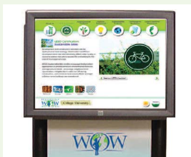
The WOW kiosk touchscreen display.